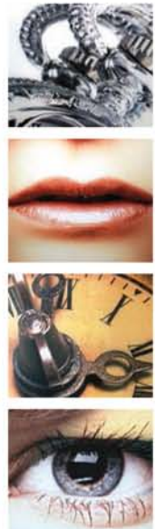
ABOVE: More examples of DigitalDistinctions™ printing on Viracon Glass.

Design without limits. DigitalDistinctions™ by Viracon finally removes the limitations of screen-printing. Now, you can print a vast number of colors on glass with complete predictability, repeatability and ceramic ink durability. Plus, you'll enjoy the benefits of greater UV resistance, transparency, and scratch resistance, while applying Viracon's solar control coatings directly over the digital image.