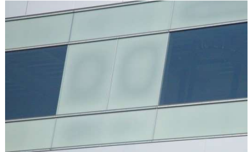
FIGURE 1: MOIRÉ PATTERN EXAMPLE

Although it is impossible to identify when a moiré pattern may appear, the following architectural glass applications, colors and patterns are generally more prone to exhibiting moiré patterns.